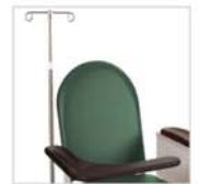
IV Pole IV