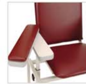
Pivot Arm PR (both models) Dual Pivot Arm P2 (2573 only)